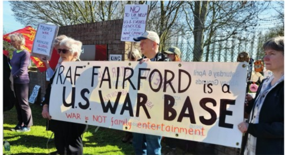
Turn to page 3 to catch up with peace protests around the country.

The speech is available from MAW in a new 32-page booklet entitled Ending Wars - a Psychological Perspective , from the Russell Foundation, for £5 plus £1 p&p flat rate. Order via abolisher.net , then go to 'support us' and then 'shop'.