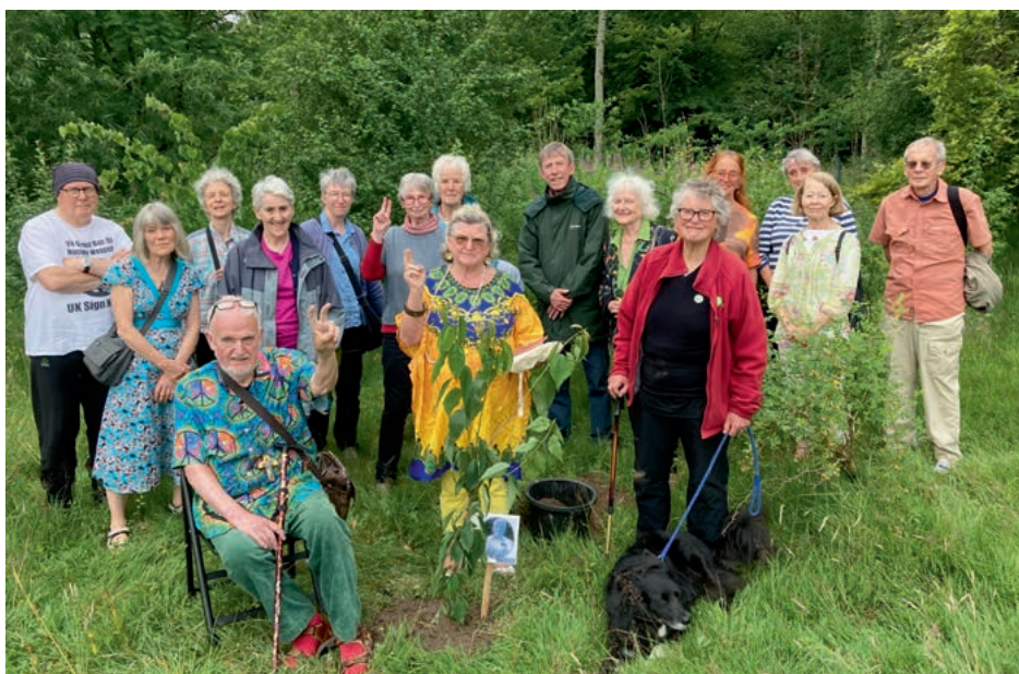
Deep roots: Members of Scottish CND and friends gathered in summer to plant a tree in memory of Bruce Kent