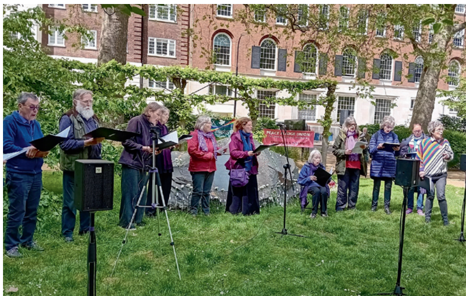
Paying their respects: The gathering for CO Day at Tavistock Square in London

MAW IS ONE OF 13 PEACE organisations which plan and support Conscientious Objectors' Day, which took place on May 15. Since 1994 there has been a London event in Tavistock Square, around the memorial stone there dedicated to the right to refuse to kill.