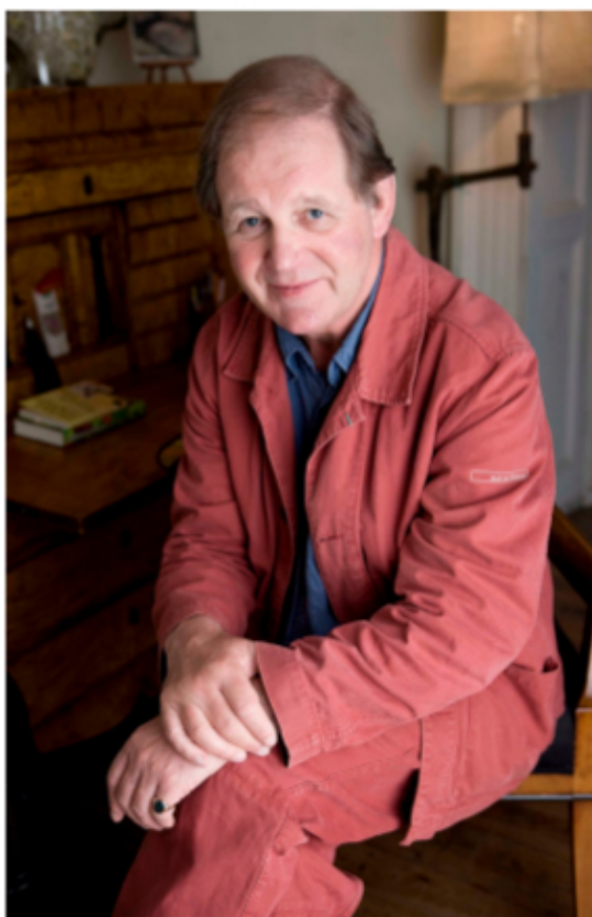
No flag-waving: Michael Morpurgo